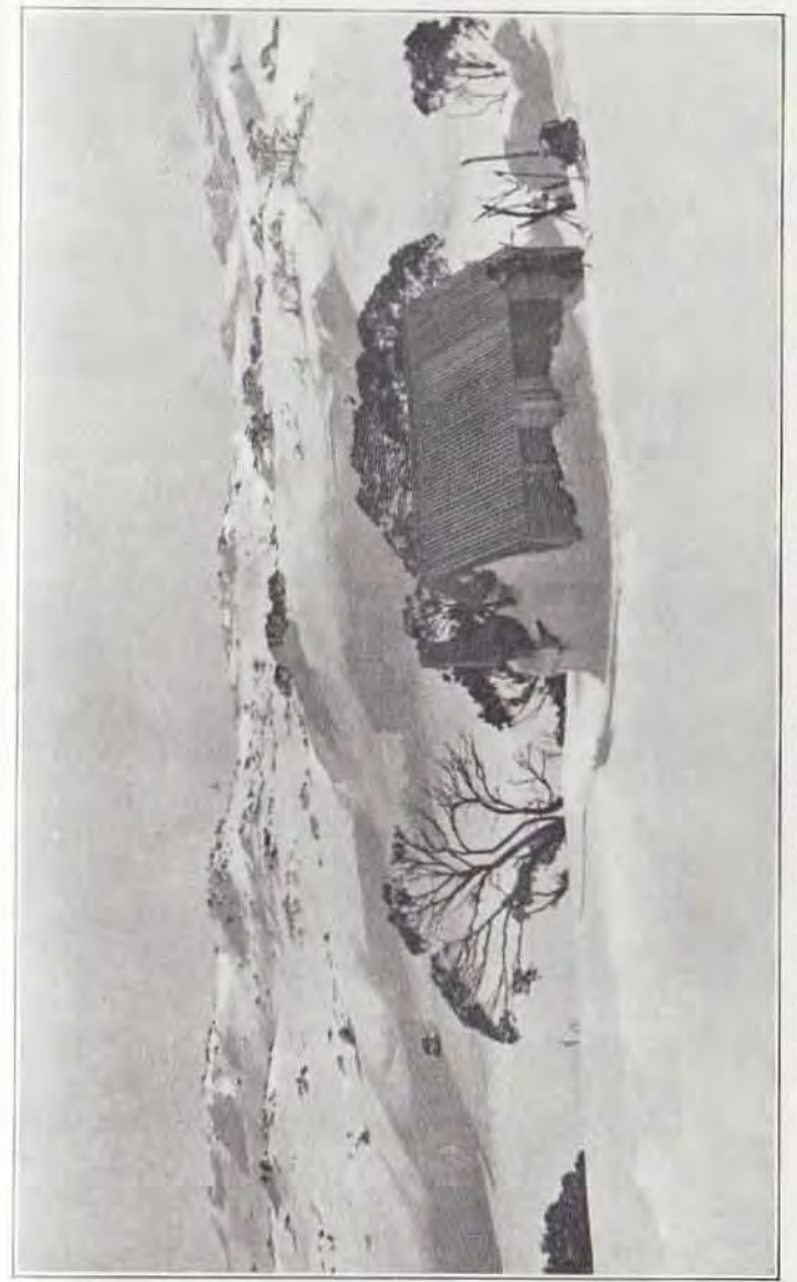
BACKGROUND THE K TIN HUT WITH MOUNT GUNGARTAN

We took with us only our few personal belongings, repair outfits, etc., and left our sleeping bags in the hut for the next party to use. During the night a good deal of snow had fallen, and the temperature had arisen and the going was bad and very heavy. We had little difficulty in finding our way in the fog, but the climb was tedious, and, to make things more annoying, we had to push ourselves practically all the way down from the Saddle of Mount