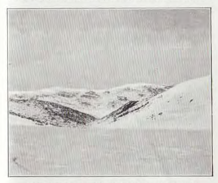
LOOKING DOWN THE GUTHEGA VALLEY FROM CONSETT STEPHEN PASS.

which we reached at about 12.30 p.m. Finding that we were running well within our schedule, we decided to take things easy and have our lunch in comfort, and it was not until about 1 o'clock that we left the Pass and started the climb up to the saddle of Mount Gungartan. This is a fairly long climb, but the gradient is not steep and in comparison to the Guthega Valley it seemed quite easy work. We crossed a small shallow valley which runs down the western side of the mountain until we came to a fence just sticking up out of the snow, and we followed this over the