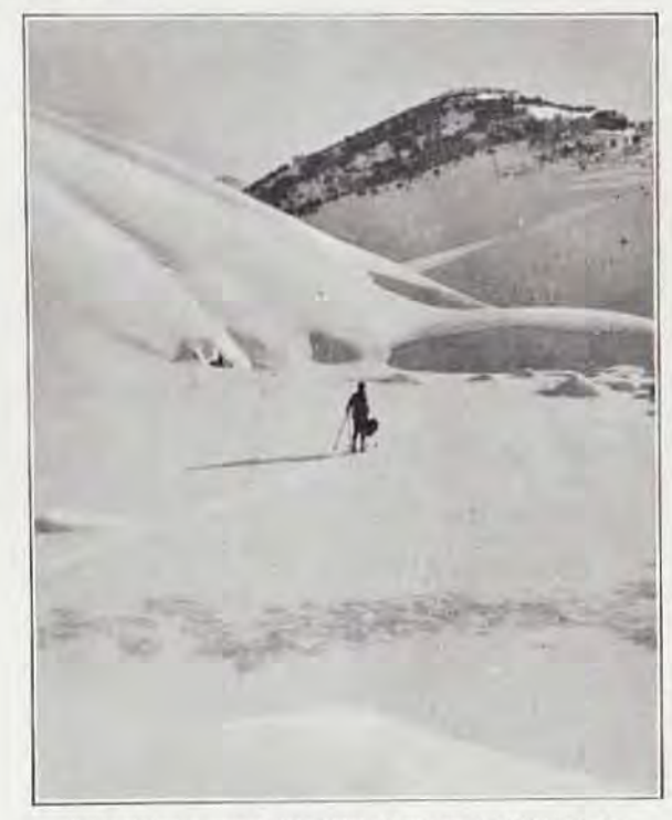
CROSSING THE SNOWY AT ITS JUNCTION WITH THE GUTHEGA.

It is sincerely hoped that this article will give at least some skiers the incentive to explore this truly magnificent tract of country.