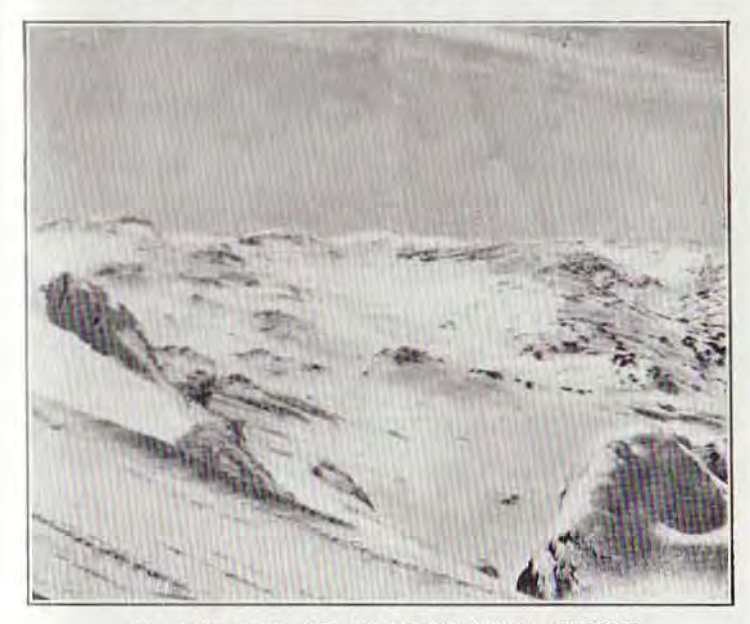
ON THE TOP OF GRANITE PEAK RANGE. Jagungal can just be seen in the centre in the distance.

Our first objective was the Cup and Saucer Hill, about half-way between the hut and Jagungal. The country here is fairly level, and, the snow conditions being perfect in the early morning, we made very good time. However, after travelling about a mile, a westerly wind began to rise, and we saw mist coming out of the valleys ahead of us, and Jagungal, which a few minutes before had stood out clearly silhouetted against the morning sky became enshrouded in a thick cloud. At the time we thought it was only a morning mist and would later clear away, so we continued down the Valentine Creek, not really thinking very seriously about it. However, the wind began to increase in intensity, the clouds ahead became thicker and thicker, and presently we were entirely enveloped in a thick fog; but as it was still very early we decided to keep on going until we were