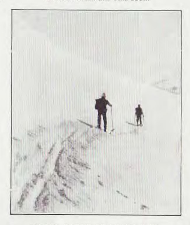
ON THE SLOPES OF MOUNT TAIT.

quite sure that dirty weather had set in. Visibility was now very bad, and we had to take our direction to Cup and Saucer Hill by compass, and it was not long before we realised that it would be folly to continue. Accordingly we decided to call a halt behind a small rocky knob which gave us some protection against the wind in order to see definitely whether the weather would clear. Half an hour's wait was sufficient to convince us that discretion was the better part of valour, and very reluctantly we decided to return to the hut before conditions became any worse. The wind became stronger still, and with the thick fog and the driven snow we were only just able to see the tips of our ski in front of us, and we had to rely solely on our compass for direction. We had hoped to follow the tracks which we had made an hour earlier, but they had already become practically obliterated and we were unable to pick them up. At first we thought it would be sufficient if we