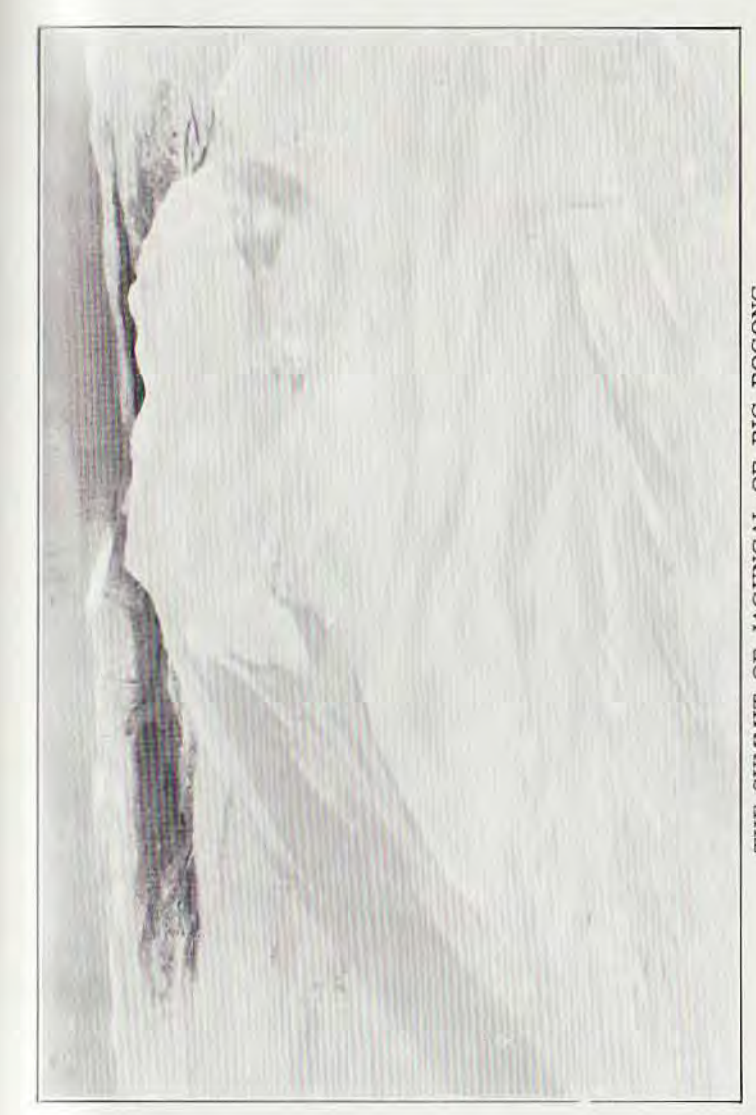
seen in the distance which climbed the mountain BOGONG. BIG OR The Grey Mares, Bogong, can be taken by a member of the party JAGUNGAL OF SUMMIT a photograph taken by THE

After proceeding up the creek bed for about half a mile we began a slow gradual ascent of the left-hand bank of the creek, always keeping on the great wall separating us from the Guthega. An hour's climb saw us on the top of this ridge, at a height of about 6,000 feet. There were one or two stunted trees near us, and we were at a considerably lower altitude at this point in our journey than any party