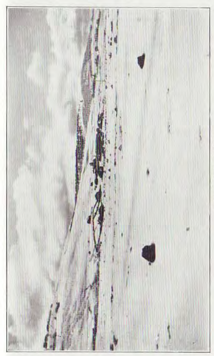
A VIEW OF KIANDRA.

Kiandra ski-ing. beginning in the sixties, has developed without any connection with the outside world. The style is not pretty. The Kiandra man rides with his feet wide