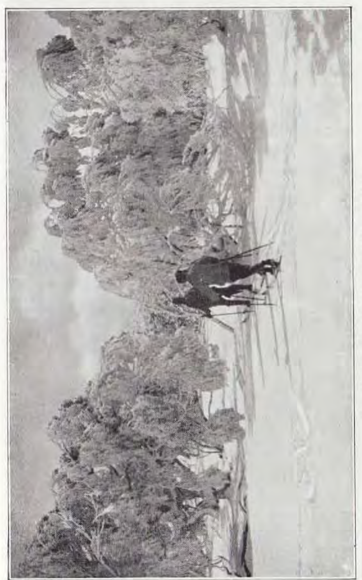
ON TABLE TOP, 10 MILES FROM KIANDRA.

On a fine day the view would be gorgeous, and even with snow-storms blowing over we managed to see as far as Jagungal, but our photographs of course were not much good. The inside of the crater was quite sheltered and carried the most wonderful snow imaginable. The trees here were very beautiful—completely covered with snow that had frozen just as it fell without thaw and the usual resultant icicles—as almost invariably happens in this part of the world. We had come up on the west side and found