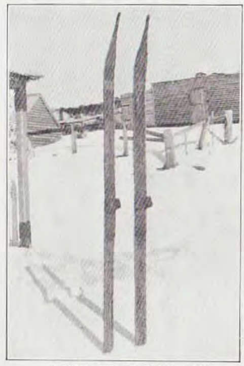
A PAIR OF KIANDRA SKIS.

of Christiania with the skis very wide apart (say 2 feet 6 inches), quite parallel, and, as far as the author could see, quite flat. The little boys when they did this started it beautifully, but, as might be expected, generally went right round and began to slide down hill backwards. The more expert, however, when pointing in the desired direction took a great step (the point of their ski going well over their shoulder), and then regained their balance with the "butter pat."