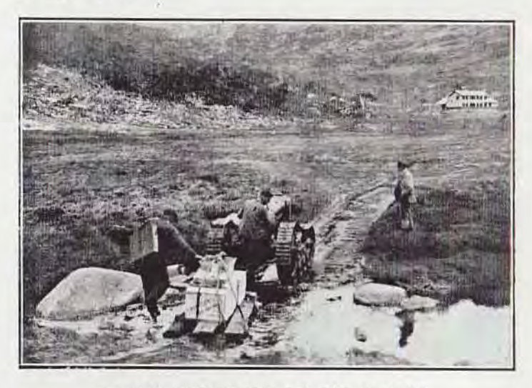
TAKING PROVISIONS TO THE CHALET.

Sleeping in a dormitory was a new experience for some of the visitors, but great comfort was provided. The heat at night did not diminish, and, instead of having to get up to throw more logs on the fire in order to prevent immediate dissolution from frost, as was the need in old Betts Camp days, blankets were tossed off the beds in endeavors to cool down.