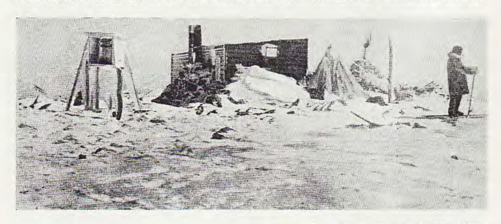
The Observatory, Spring, 1898.

Wragge, who had done meteorological work in Scotland, persuaded the Tasmanian Government to put an observatory on Mount Wellington in June, 1895. In 1897 he was Government Meteorologist for the Colony of Queensland (before Federation, hence before Federal control of meteorology), and obtained the ap-