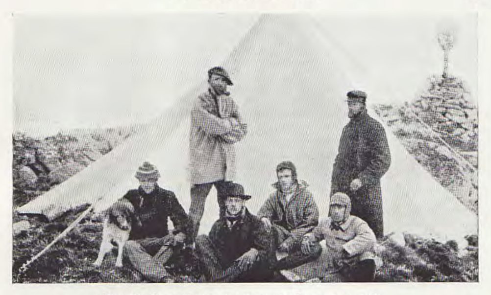
The Staff on Kosciusko Summit, December, 1897.

temperature had considerably fallen by 4 p.m., but in mid-winter and onwards the temperature was maintained until this time. A fall of decreasing rapidity then took place until the minimum. The colder the month, the smaller the changes. The absolute minimum for the year was 11.8^{\circ} in September.