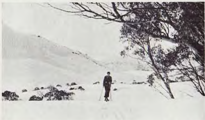
Near Pounds' Creek, showing, in the left background, the last 300 feet of the proposed new downhill course.

At "D" there is a sharp drop into an icy valley, along the side of which a great speed is obtained. At "E" a variation is made by turning left to a large clump of rocks ("F") where amusing running is made by leading the course through some wind tunnels among the rocks. From "F" it is a short dash to the top of a wood ("G"). Here one encounters the final steep drop to the Snowy, and a sharp turn is needed on an extremely steep slope to round the corner of the wood and get into position for the final schuss to Farquaharson Finish ("H"), which is made all