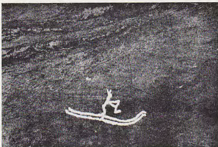
Stone-Age Rock Carving from Roedoe.