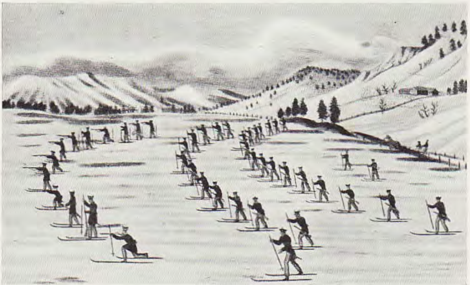
Military Ski Training, 1790.

The earliest known Norwegian sign of ski-ing is a Flint Age carving on rock at Roedoe, in Northern Norway (see Figure 1). Marshes and bogs provide the earliest examples of ski available to us. A ski tip found in a marsh at Mushom, in West Agder, in Southern Norway, comes from the Bronze Age—about 2,500 years ago. Portions of ski have also been found in bogs in other northern countries, and date from prehistoric times. (See Dr. Nils Lid, "The Ski found at Oevreboe", 1932.) The Norse sagas refer frequently to ski-ing, especially in the eastern and northern districts of Norway. They occasionally mention the Lapps as the leading ski-runners of that time; in fact, however, Norwegians were using ski long before the Lapps immigrated to Norway, and the frequent references to Lapps and ski in early Icelandic literature may be attributed to a mistake made by the non-ski-ing Icelanders as to the real situation on the Continent. The Norse ancestors of the Icelanders came mostly from the villages of the Norwegian west coast, which, to this day, have a primitive ski-ing technique. Many words in the Lapponian ski vocabulary show Nordic influence. The Lapp name of the groove ("oales") is obviously a word derived from the ancient Norse word, "ala".