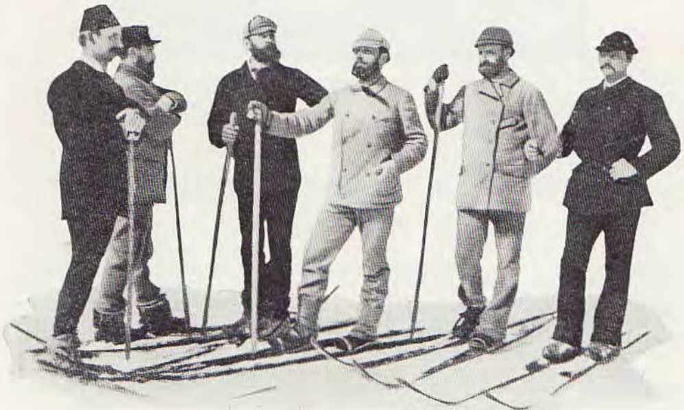
Telemark Ski, 1883.

To come now to the various types of ski and their variations as between districts. In the various wapentakes (districts) the local types have been preserved. First, we must mention the Oesterdalski (the long ski and "andor"), which is also known as the Central Nordic type, since it is not found in countries other than Norway, Sweden and Finland. The "andor" is covered with skin, the long ski is commonly made of the "tennar", of pine or spruce, that is, the wood which has an abnormal cellular evolution, and therefore does not clog in wet snow. The pitch in the "tennar" of a tree lies eccentric, the year circles of the tree on the "tennarside" being much broader than on the opposite side of the tree. The runner stood on the longer ski and pushed with the "andor". The "andor" never clogged and was used also for turning. The technique for such ski was, of course, entirely different from the modern manner derived from the Telemark area. Before the era of waxing, many long-distance races were won by skiers using this type, which has now almost disappeared. The long ski was from 2.20 to 3.20 metres long, and 4.5 to 7 centimetres broad. The "andor" was 1.60 to 1.90 metres long, and 7 centimetres broad. The ski had generally parallel edges, instead of the narrow-waisted shape of the Telemark ski.