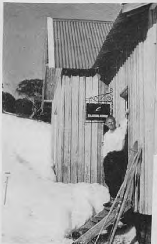
Right: Author, outside Illawong.