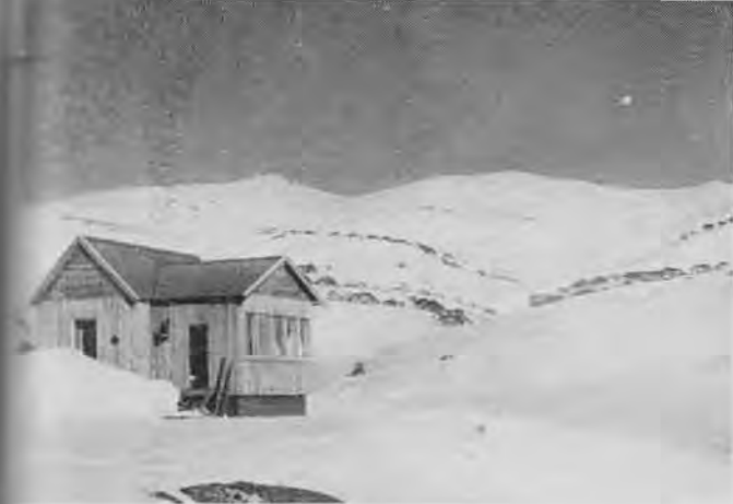
Above: Illawong, with Mt. Twynam in the background.