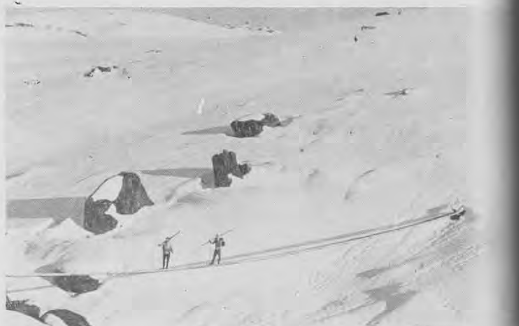
Snowy River Bridge with Mt. Twynam in the background.