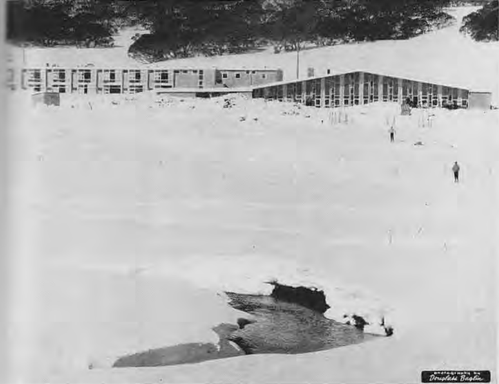
The Man from Snowy River Hotel in the Perisher Valley.