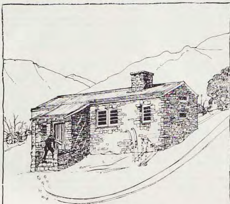
.. THE CLEVE COLE MEMORIAL HUT .. .. MOUNT BOGONG ..