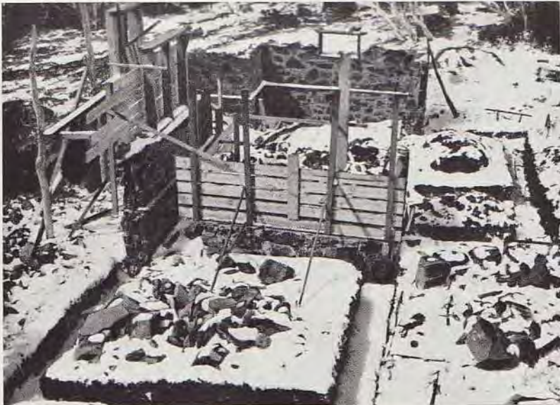
Building of the new Hut in progress.