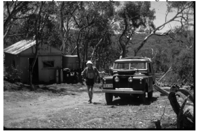
Chris Davey with CSIRO Landrover at hut, 1960's

The hut and study area are in the valley of the Gungarlin river, Kosciuszko National Park, GPS coordinates 0640149 - 5989306 for the hut and 0639546 - 5989562 for the study site and hide. The map used is Eucumbene 1:50000. There is a vestigial 4WD track from the hut to the study area of approximately 1 kilometre long and in a roughly NW direction