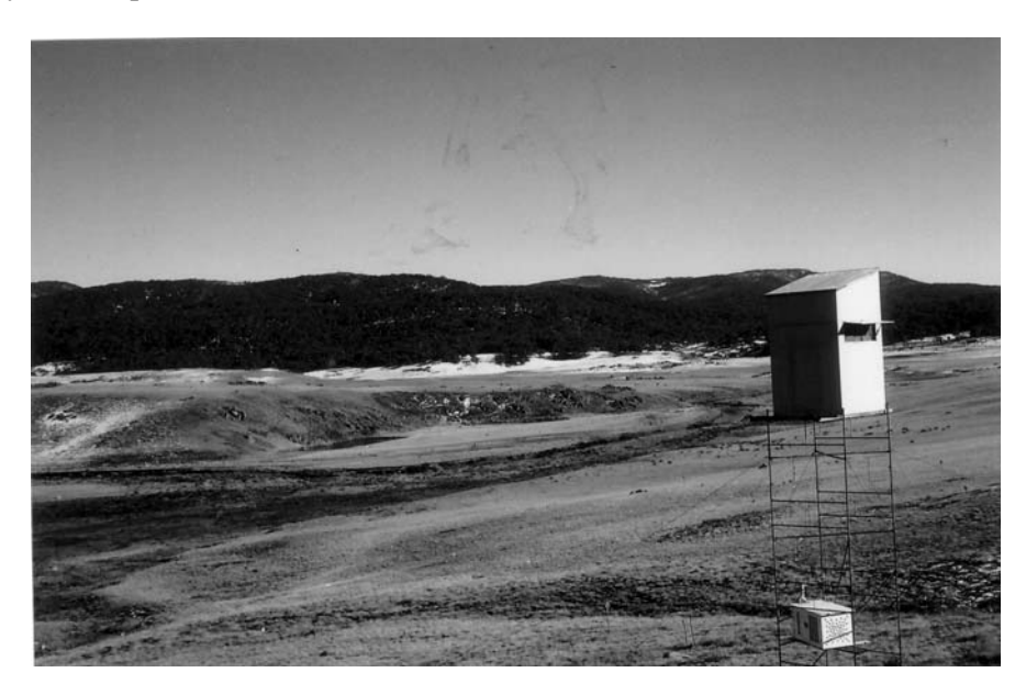
Hide, study site and winter snow.

A Stevenson screen was next to the hide to give daily readings on temperature, rainfall, humidity and evaporation.