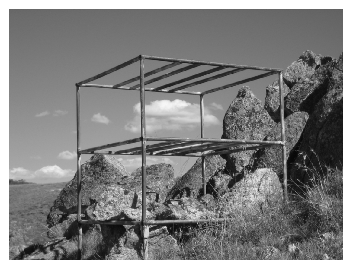
Pipe base of smaller hide at opposite side of study site

A second and smaller hide was built later, some time after 1966, overlooking the flat at GPS 0639100 - 5989800. The pipe base of this structure is till in place.