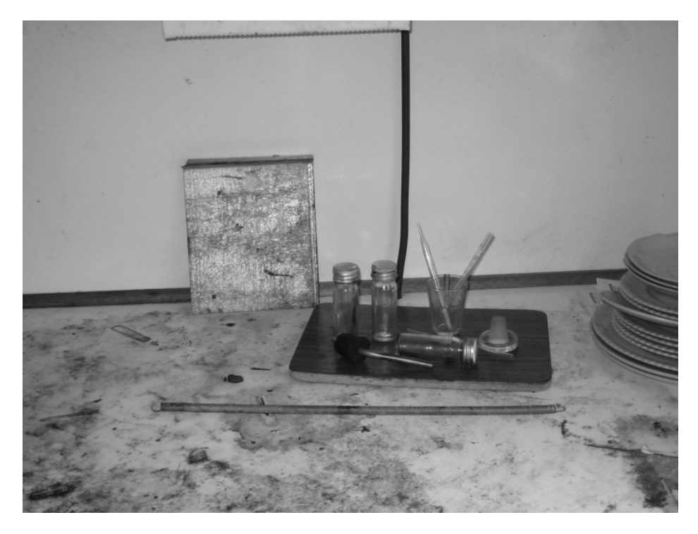
Some equipment and plates still in the hut in December 2005